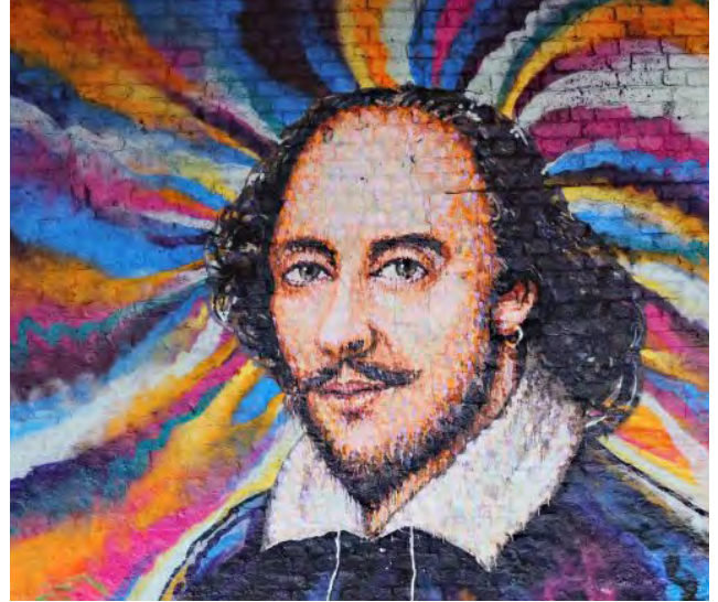
Mural in London - uncredited

William Shakespeare was an English playwright who lived between 1564-1623. He is credited with writing over 37 plays and numerous poems in his lifetime, and people are still performing his plays today. Shakespeare's plays have proved to be timeless with their intricate plots and intense drama, funny one-liners, big love stories, ghosts, queens, kings, buffoons, enormous mix-ups and mistaken identities, not to mention murders, coups, political plots and betrayals. Some are comedies, some are dramas, some are based on historical figures. The plays are memorable for their compelling stories, intense characters, and above all, their extraordinary, complex, and beautiful language.